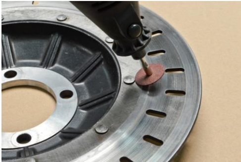
Correct way: grind on side of the outer ring.

Remove the rivets from the brake disc with care. This can be done with a small axle grinder or by drilling. Make sure not to damage the inner ring itself. When using an axle grinder, only grind on the side of the outer ring like pictured below.