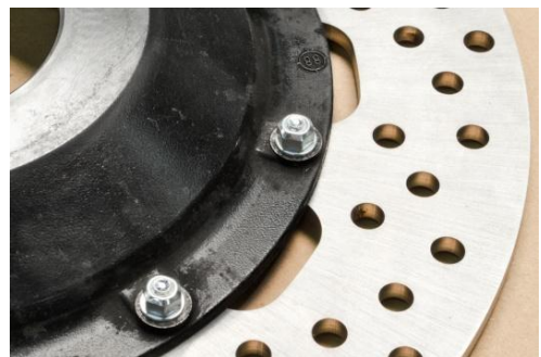
... > Flat washer > Nut. Torque tighten the nut to 6 Nm.