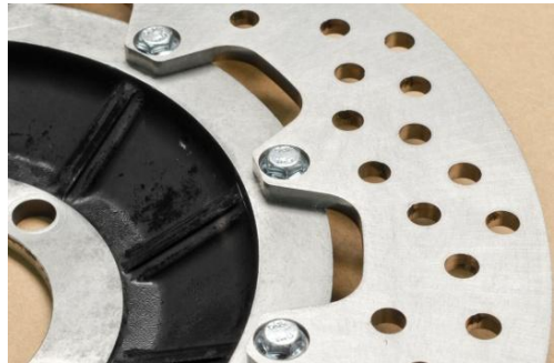
Bolt > Outer ring > Inner ring > ...